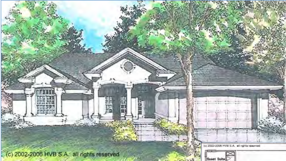
(c) 2002-2006 HVB S.A. all rights reserved